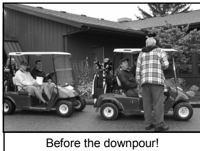
Before the downpour!